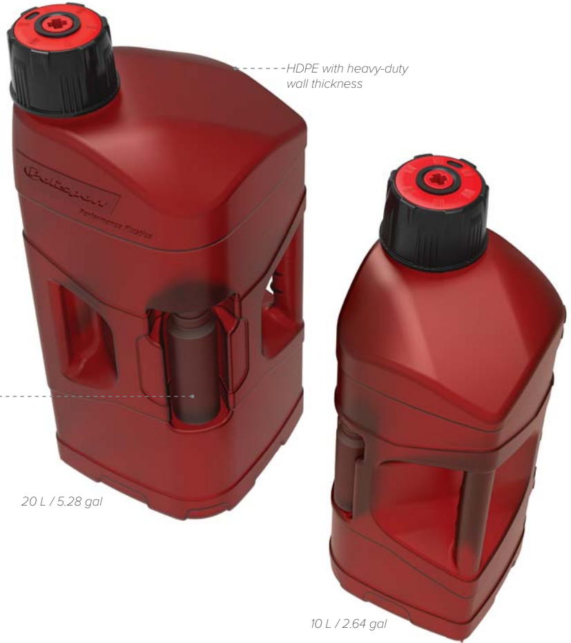
20 L / 5.28 gal