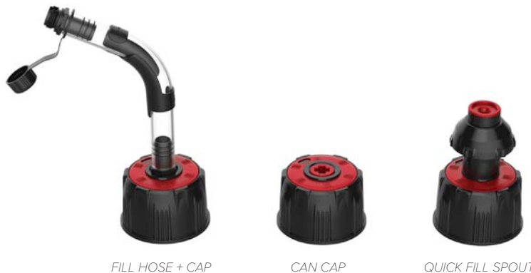
FILL HOSE + CAP