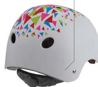
triangles (white matte/orange straps)