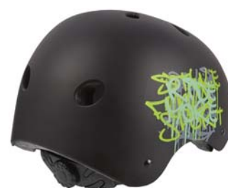
graffiti (black matte/green straps)