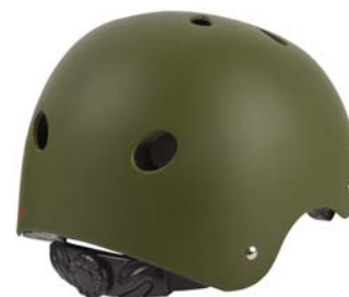
tag (green matte/orange straps)